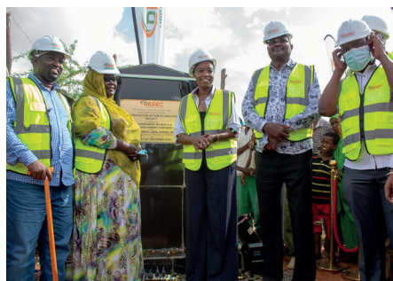
CS Energy Amb. Dr. Monica Juma unveils the plaque during the ground breaking of EPFP

In December, REREC launched a Ksh 6.4 billion electrification of public facilities project to light up 131 constituencies in 35 counties. The project (commonly known as BADEA) is funded by a consortium of Arab Development partners and will result in the electrification of over 1,200 public facilities (market centres