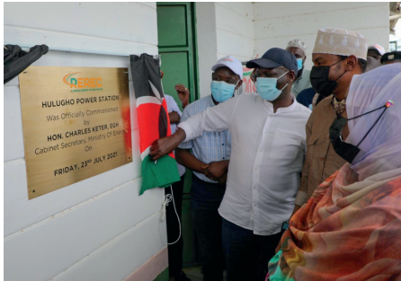
Former CS Energy Charles Keter unveils the plaque during the commissioning of Hulugho Power Station

In July, REREC gave the people of Hulugho in Ijara Constituency, Garissa County a reason to smile when the Hulugho mini-grid power station was officially commissioned on Friday, 23rd July 2021. The mini-grid will serve over 110 customers including 7 public facilities; among them a police station, a health center and 5 schools.