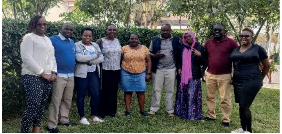
REREC staff pose for a group photo after the training.

REREC staff drawn from the AIDS Control Committee in conjunction with the National Aids Council (NAC) held a training session in Naivasha from 7 th to 11 th March 2022 on aspects regarding control of HIV and AIDS in workplace.