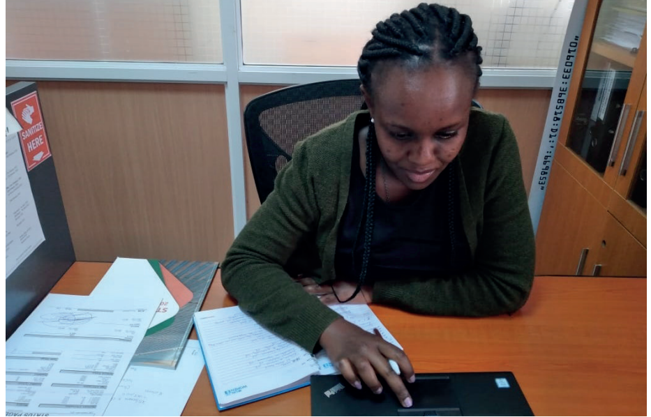
A new staff member at her workstation in Kawii Complex

Two hundred and thirty (230) new employees are set to join REREC in various capacities following a recruitment drive that has been successfully concluded by the Corporation.