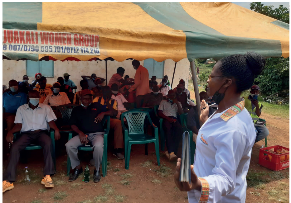
Community sensitization session in Mageta on 03/02/2022

The Corporation recently dispatched 4 teams to fast-track land acquisition that will in turn inform the construction and completion of the Kenya Electricity Modernisation Project (KEMP).