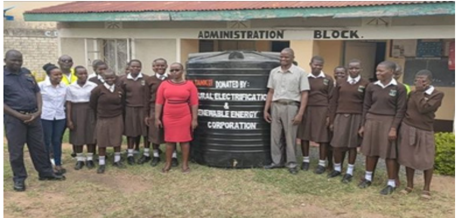
REREC staff donating water tanks.

The emergence of the COVID-19 pandemic across the globe affected people's livelihoods and ways of life. Simple things like shaking hands, sharing public space & freely interacting with each other became a thing of the past. Certain strategies to curb the spread of infections were imposed and became the norm in our day-to-day lives. It became the responsibility of an individual to ensure they keep themselves safe.