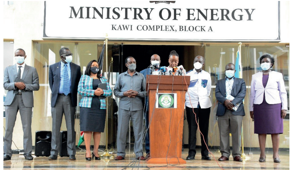
Cabinet Secretary for Energy Amb. Dr. Monica K. Juma, (Oxon), EGH addressing the Media in Kawi Complex on 21st January 2022

The Cabinet Secretary for Energy Amb. Dr. Monica K. Juma, (Oxon), EGH, has said that the ongoing Energy sector reforms are irreversible and the government will not relent on the implementation.